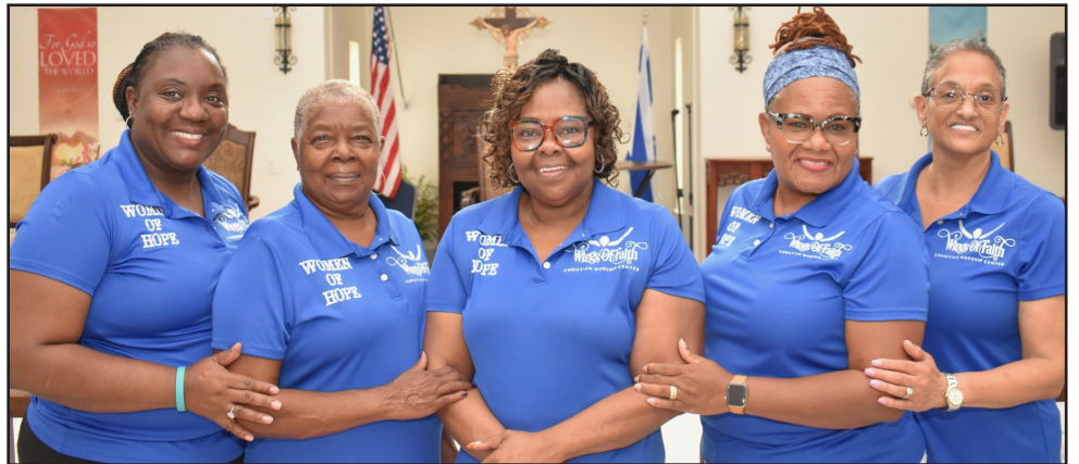
The Wings of Faith Women of Hope Ministry.

They bring the powerful fire of the gospel to our female inmates on Saturday, a day that many people are relaxing with family. Being inspired by the word of God, they illuminate Cell 12 with gospel singing, praise and worship, and bible study that turns into a revival each time they volunteer. The entire unit atmosphere changes because the holy spirit enters with them, and it can't be shaken. Many are touched with shouting and will have joy of tears running down from their eyes because of hope and feeling the breaking of chains; even though they are locked behind walls and doors, chains of burdens and worrying just hit the floor. The females know that these women are